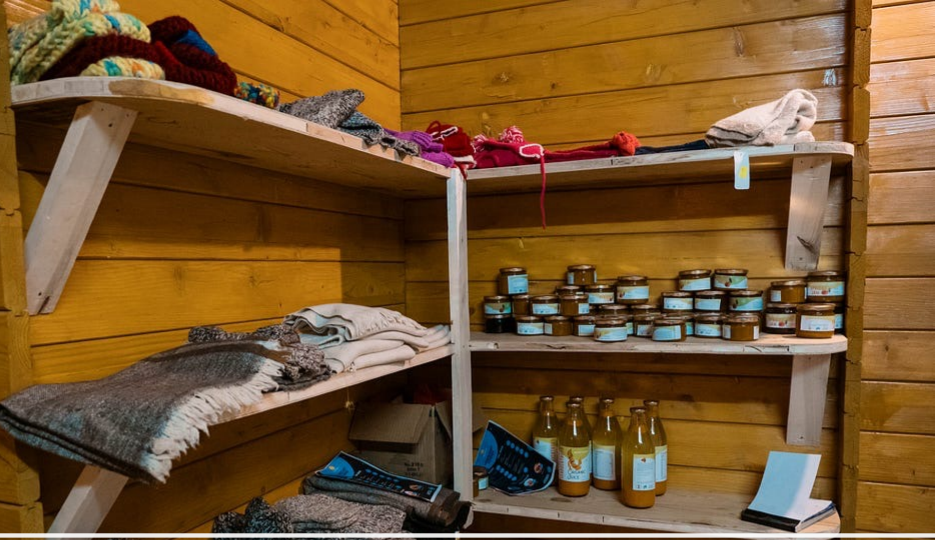
Local Handicraft Souvenirs at Cosmohub